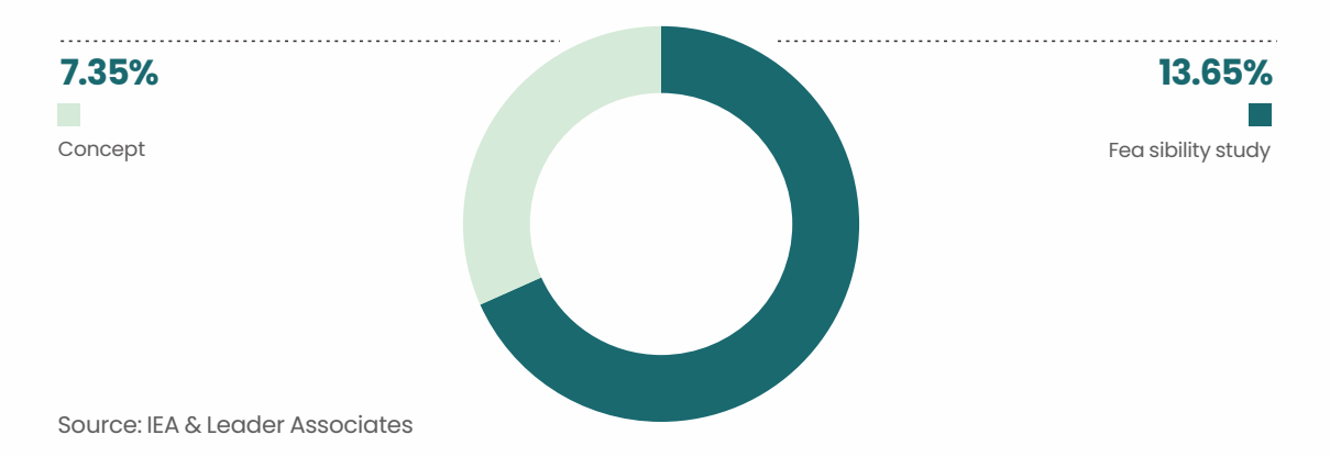
FIGURE 3: TOP 20 GREEN HYDROGEN PROJECTS BY STATUS